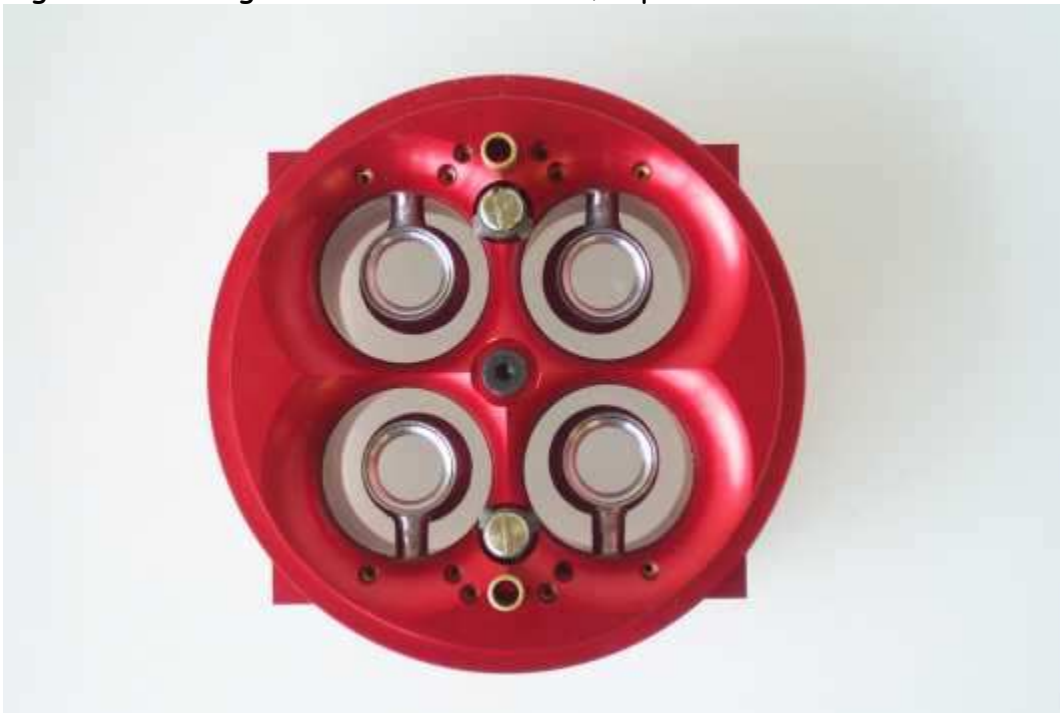
Big billet housing with skirted boosters, bottom view