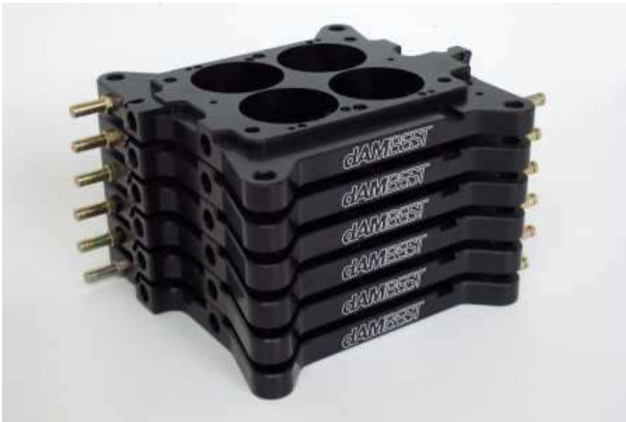
Slip Link Throttle Shafts