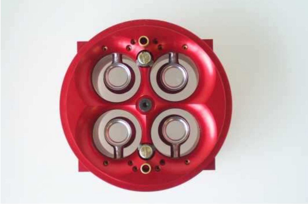
Big billet housing with skirted boosters, bottom view