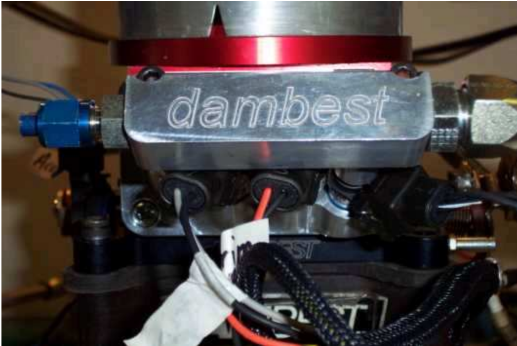
The wiring is small and elegant.