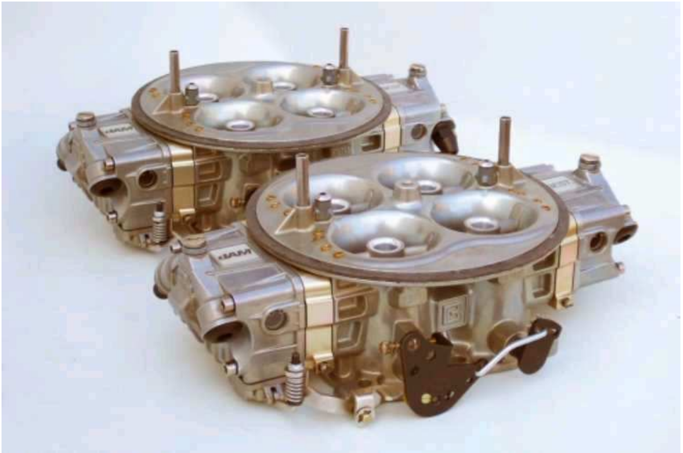
New Shear Technology