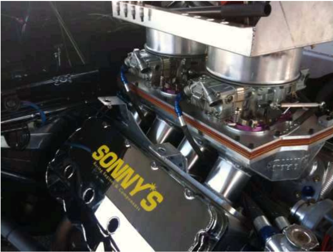
Todd Hoerner's engine with dAMBEST modified Braswells set the A/AA record the first race they competed in. The current record set at Atco 6.52 @ 214.35 .