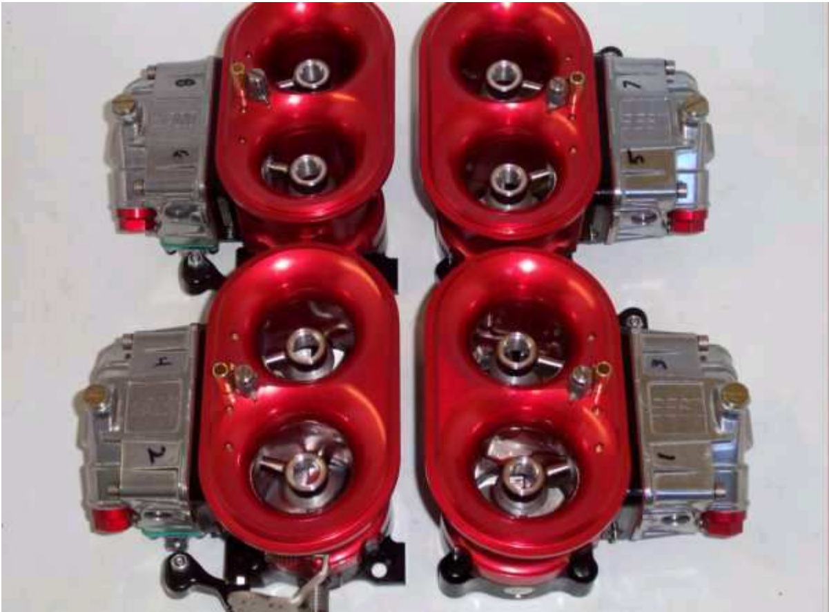
All our latest booster technology